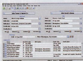
Software package Family Tree Maker's editing and navigation screen is simple to use.

Start your trawling of the internet by using one of the free services. FamilySearch, www.familysearch.org is provided by the Church of Jesus Christ of Latter-Day Saints (the Mormons), which has accumulated genealogical information from all over the world and makes it freely available on its website. Here you'll find the International Genealogical Index (IGI), which contains extractions from many British parish registers and the 1881 census index for England and Wales, as well as information submitted by the