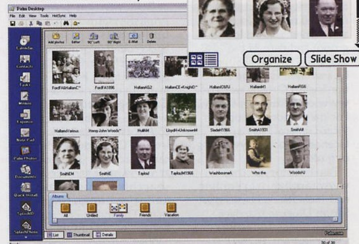
First assemble your photos in Palm Desktop on your PC then you can view them on your Tungsten E.