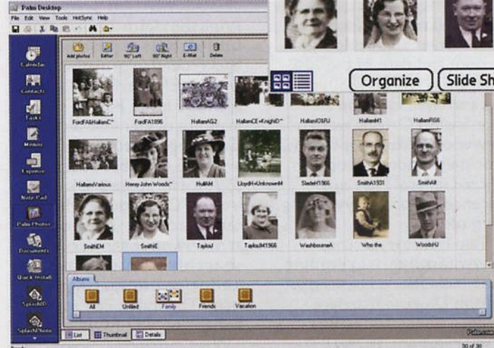
First assemble your photos in Palm Desktop on your PC then you can view them on your Tungsten E.